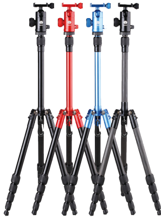
T-005X Aluminum Tripod Kit T-025X Carbon Fiber Tripod Kit

Now with removable Center Column for low-angle / table-top photography and Carabiner Clip for easy transport / hanging weights